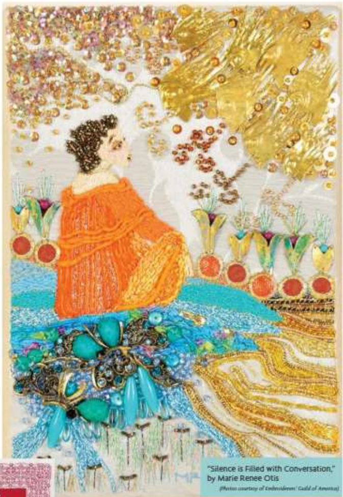
"Silence is Filled with Conversation," by Marie Renee Otis